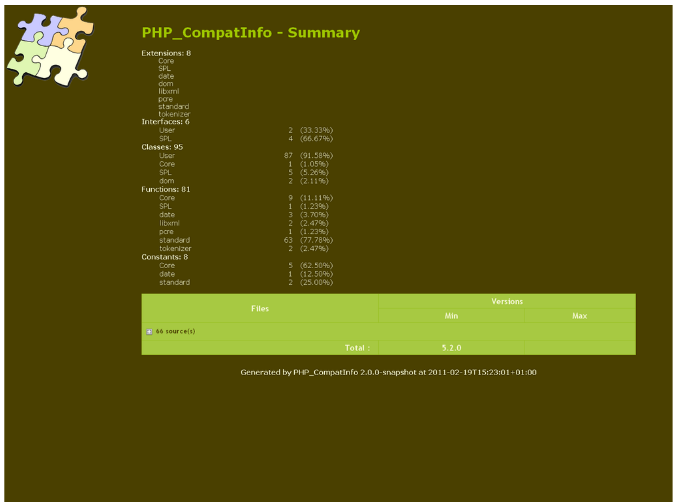
Figure A.1. Example with sources file list collapsed

$ xsltproc -o <output_page.html> summary.xsl <report.xml>